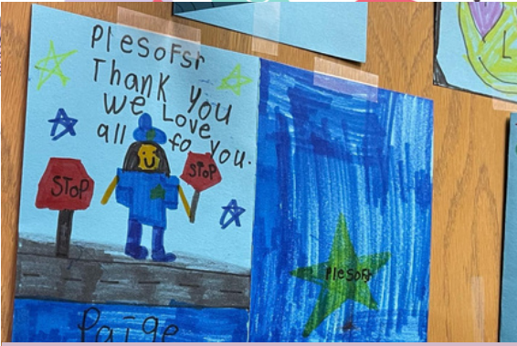
THANK YOU FALLS LAKE ACADEMY!