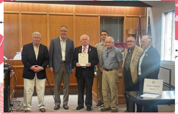
TRLC TRAIL CREW "YEAR OF THE TRAIL" PROCLAMATION FROM THE MAYOR